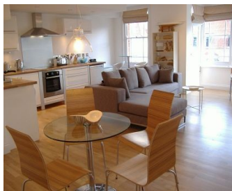
Spacious lounge/dining room with south facing balcony . . .

Bedlinen and towels can be supplied and cycle hire arranged (supplemental charges apply)