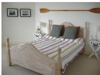
Spacious Master Bedroom with double bed, 54b has a further two bedrooms, a twin and a single and sleeps 5.