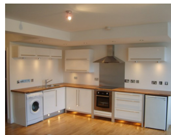
Newly fitted, well appointed modern kitchen . . .